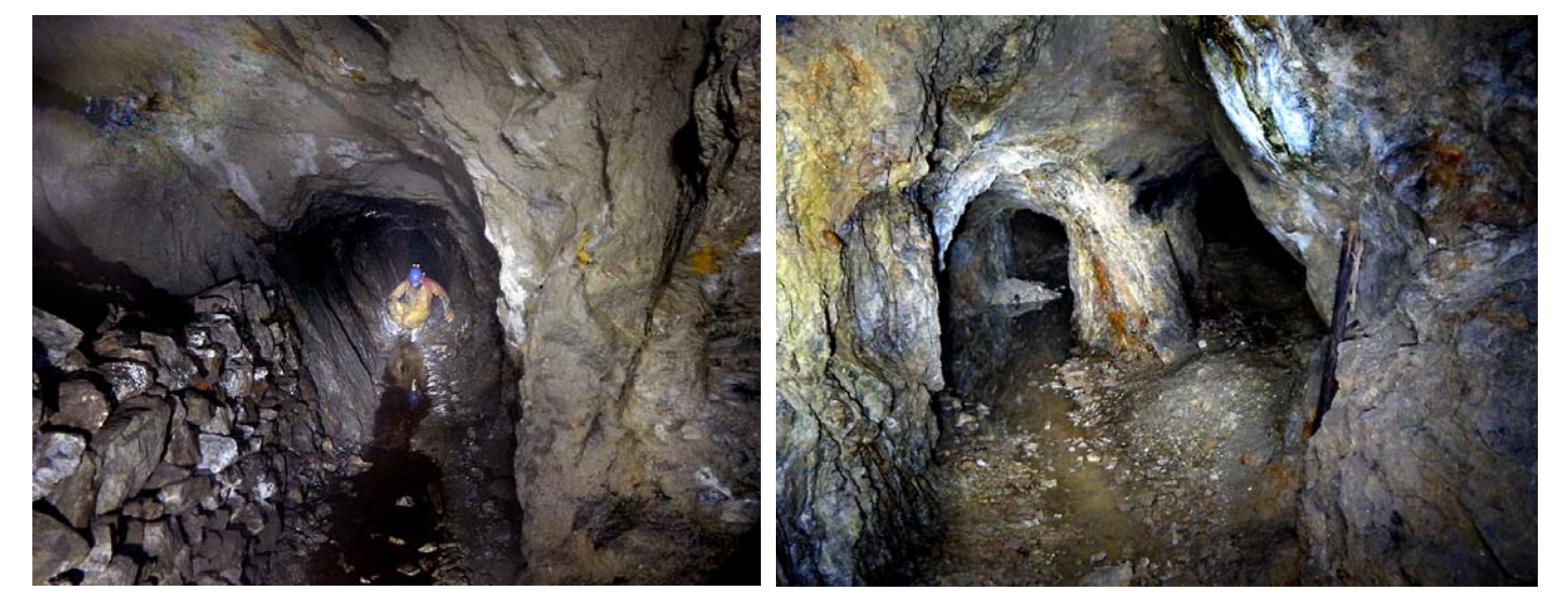
Phil exploring Cystanog Level 2