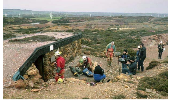
Sorting kit on the surface

The show is part of a series which is to be broadcast at peak viewing time on ITV1 in late February and March 2016, aiming to show aspects of science in a popular and entertaining way. Olly Burrows