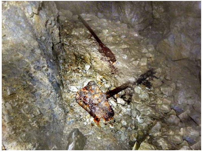
Old tools found on entry to the level