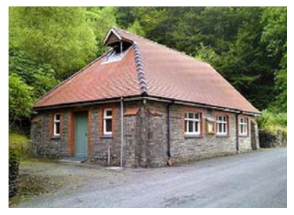
Ysgoldy-Goch Community Hall

There is only very limited parked at the hall itself, but there is plenty of parking in the Hafod Forest car park 300 yards along the road.