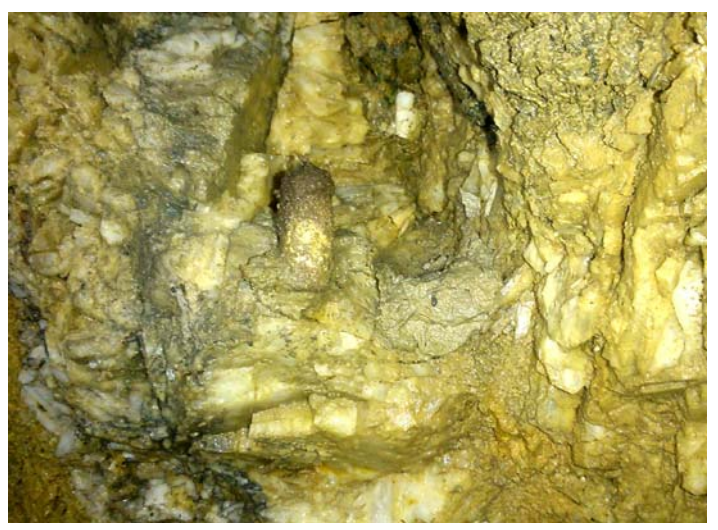
Remains of a candle perched on a ledge

Please send news items, short articles, club profiles and newsworthy photographs (at their original resolution as we will fit them to the page) for the next issue to Dave Tyson by 31st March 2016