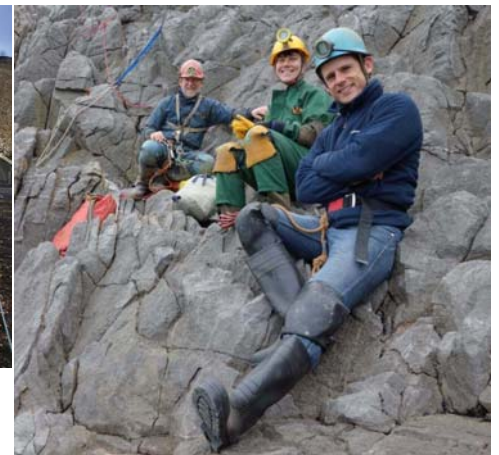
Right: The Ogof Govan research visit