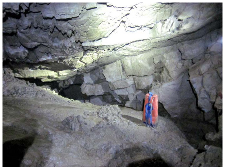
Back wall of the chamber at bottom of shakehole