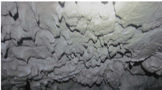
View of chamber ceiling