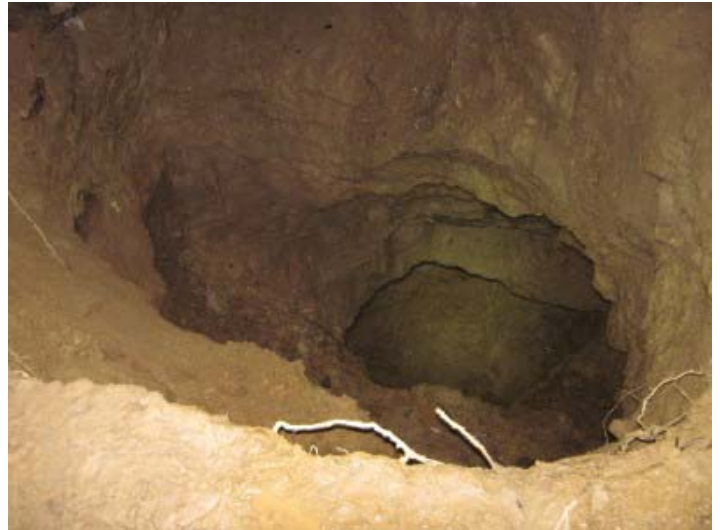
Inside the cave looking down the shakehole