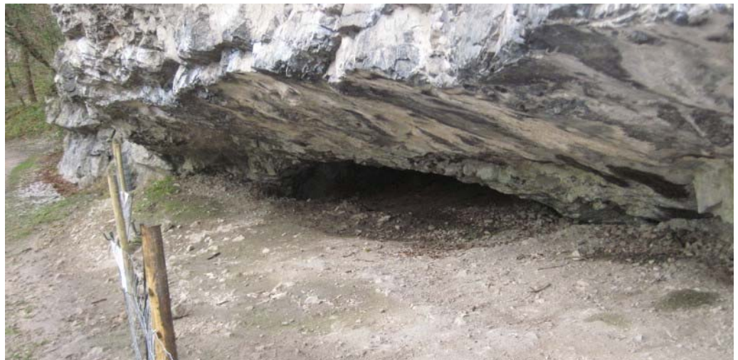
Fenced off entrance to 'Leete Cave 2' containing the new shakehole